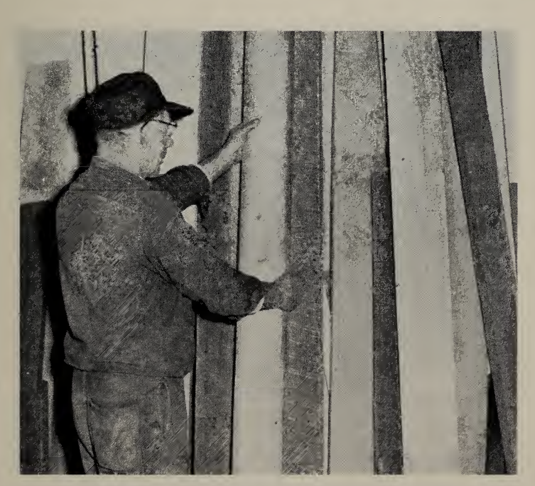
The sawmill produced 616,136 ft. b.m. of lumber.